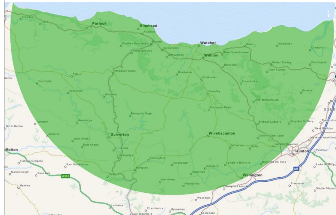
Map Showing Area for Local Entries (15 miles as the crow flies from the showground)